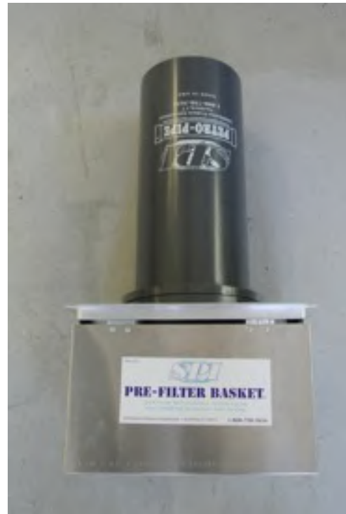
Petro-Pipe and Pre-Filter Basket