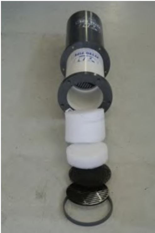
Current Petro-Pipe Internal Filters

Older Petro-Pipes will get new filters when replacement dirt filters are ordered