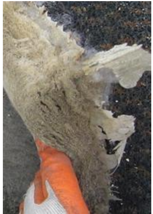
Dirt Filter batting that needs replacement.