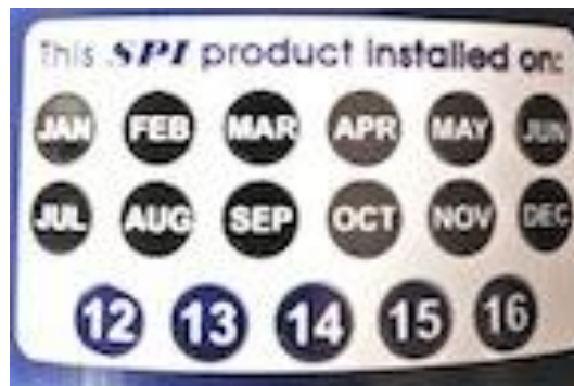
Date Stickers for SPI Products