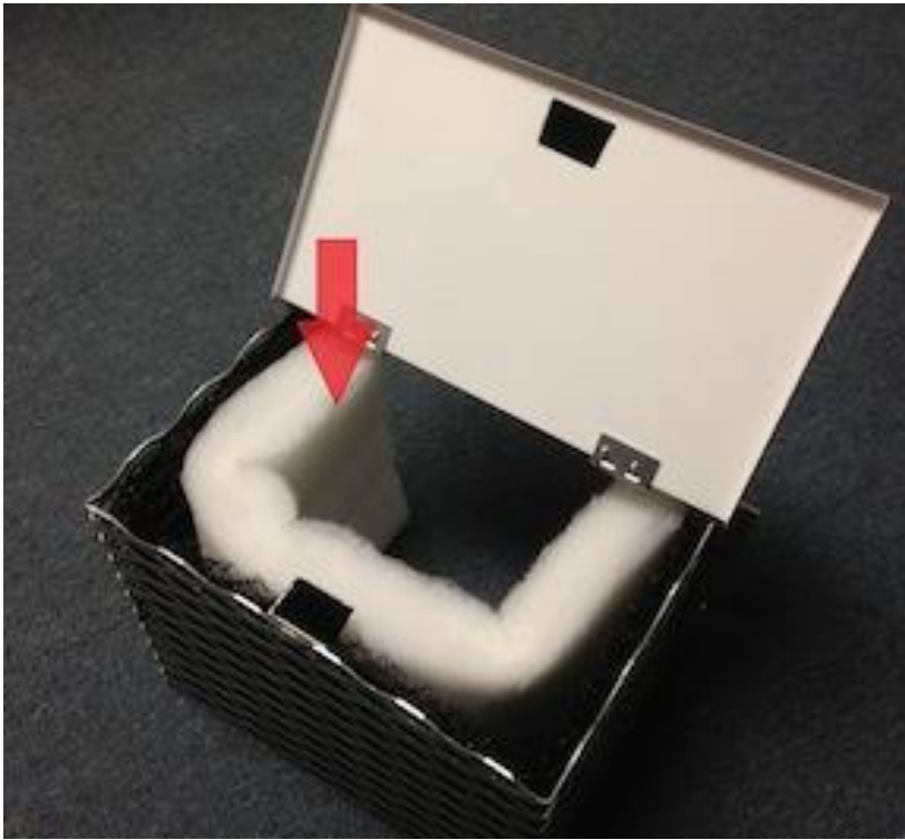
PFB-1012 Filter basket with Floss Batting can be easily removed and replaced